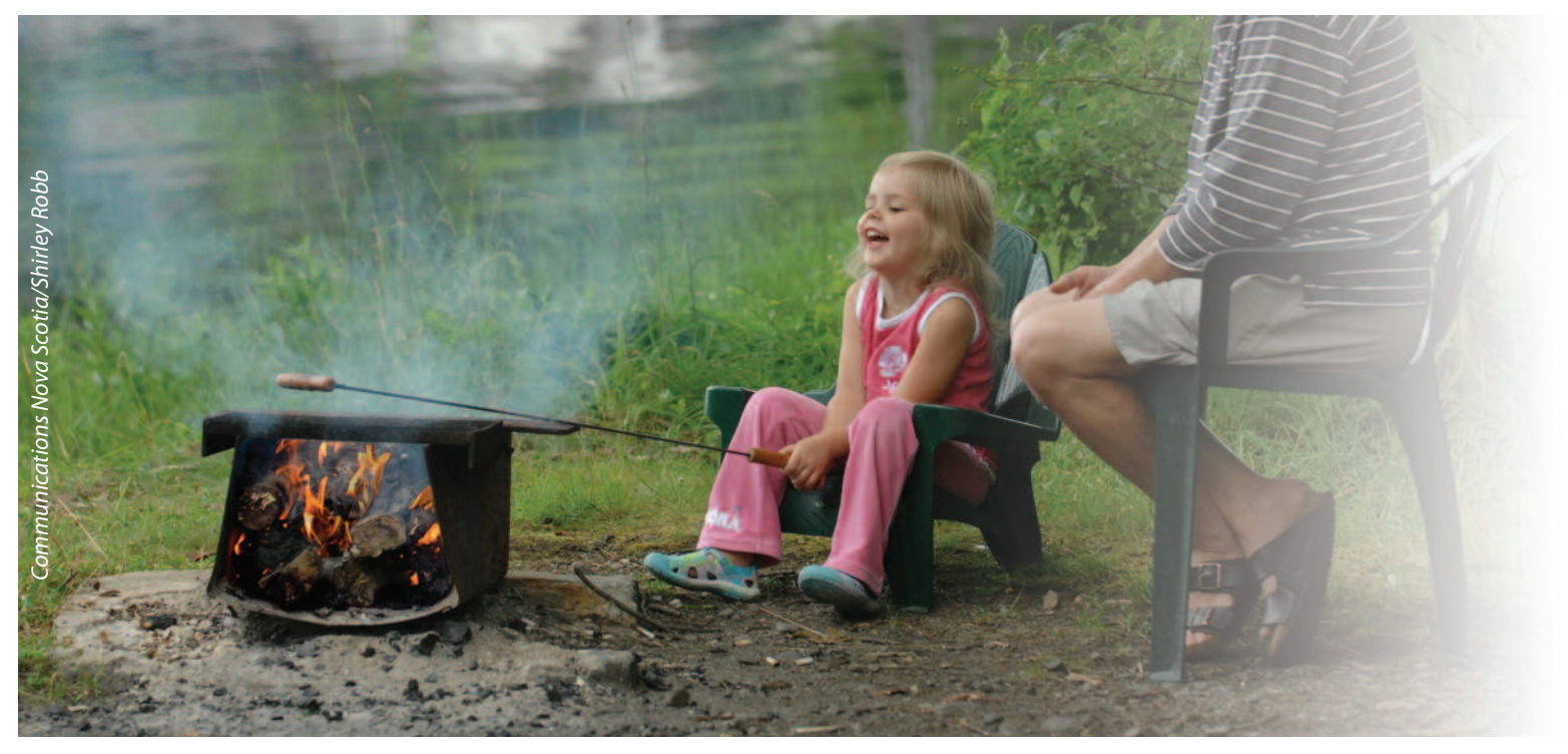
The Islands Provincial Park, Nova Scotia