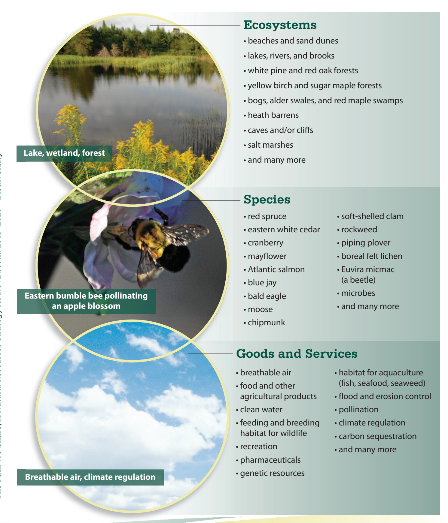
Figure 3-1. Components of biodiversity