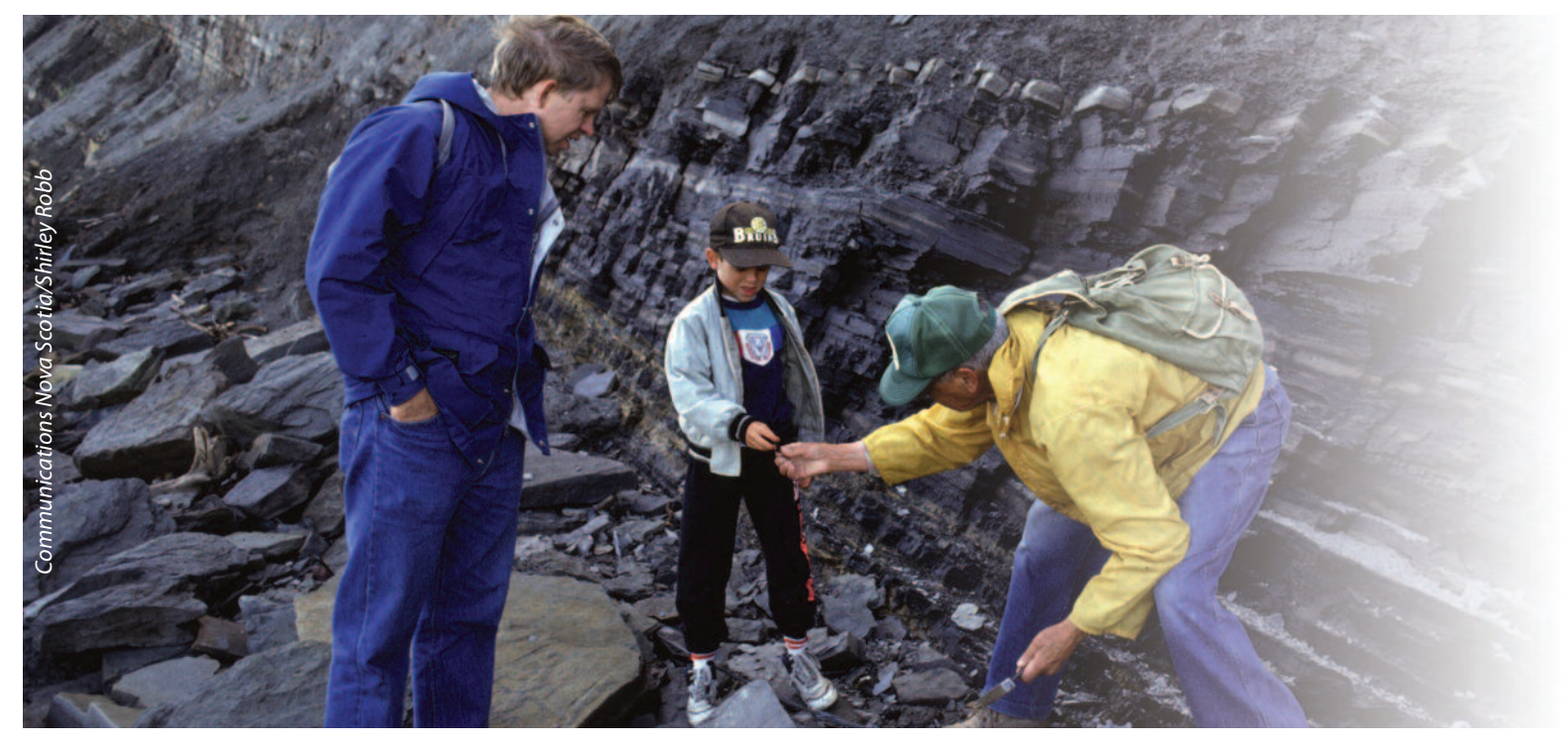
Exploring the Joggins fossil cliffs on the Bay of Fundy, Nova Scotia