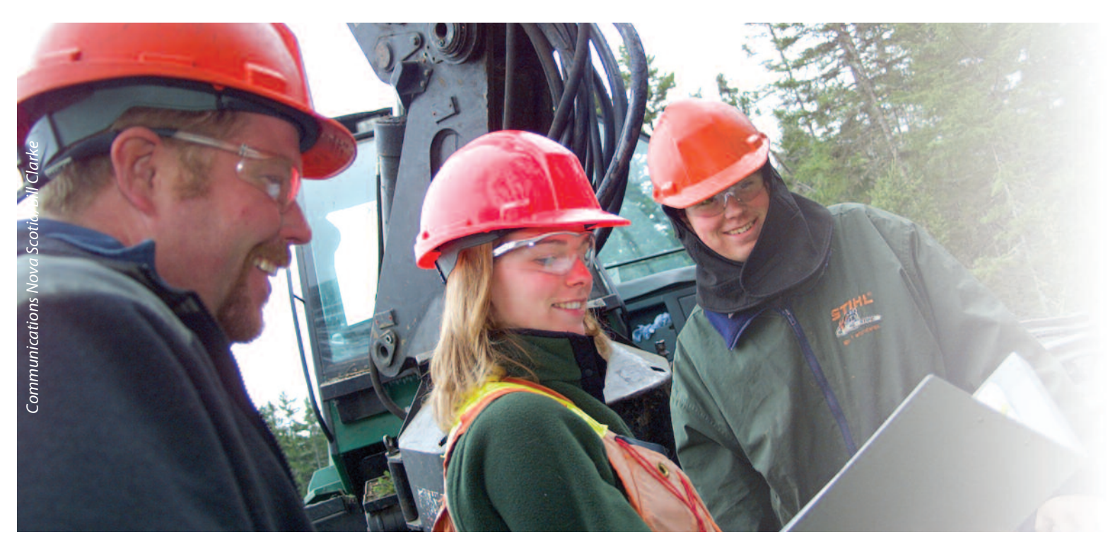
Forestry workers, St. Margarets Bay area, Nova Scotia