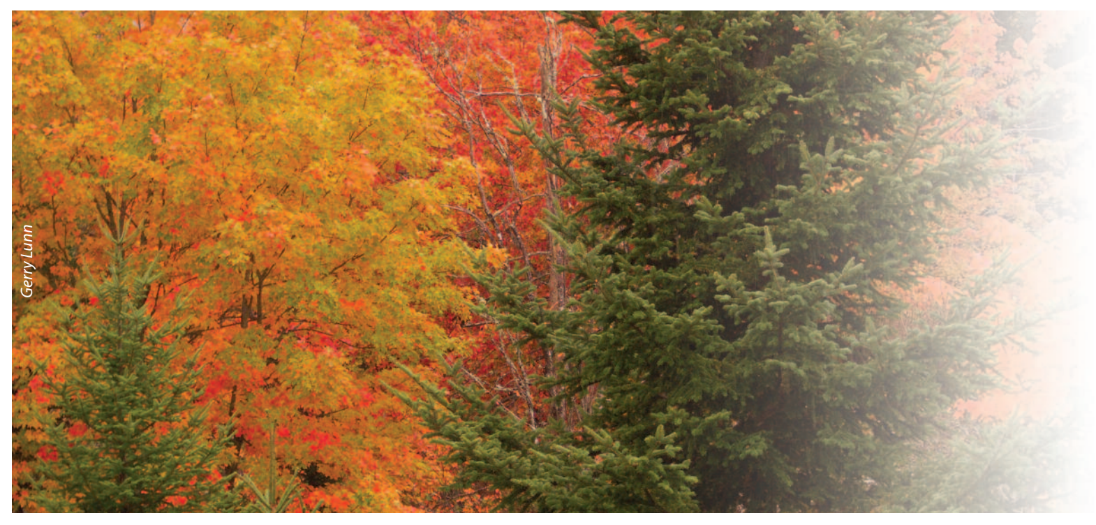
Trees, Middle Sackville, Nova Scotia