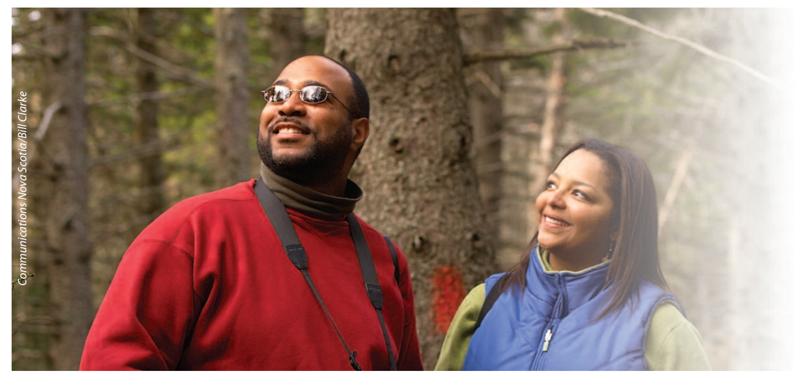
Hikers at Blomidon Provincial Park, Nova Scotia