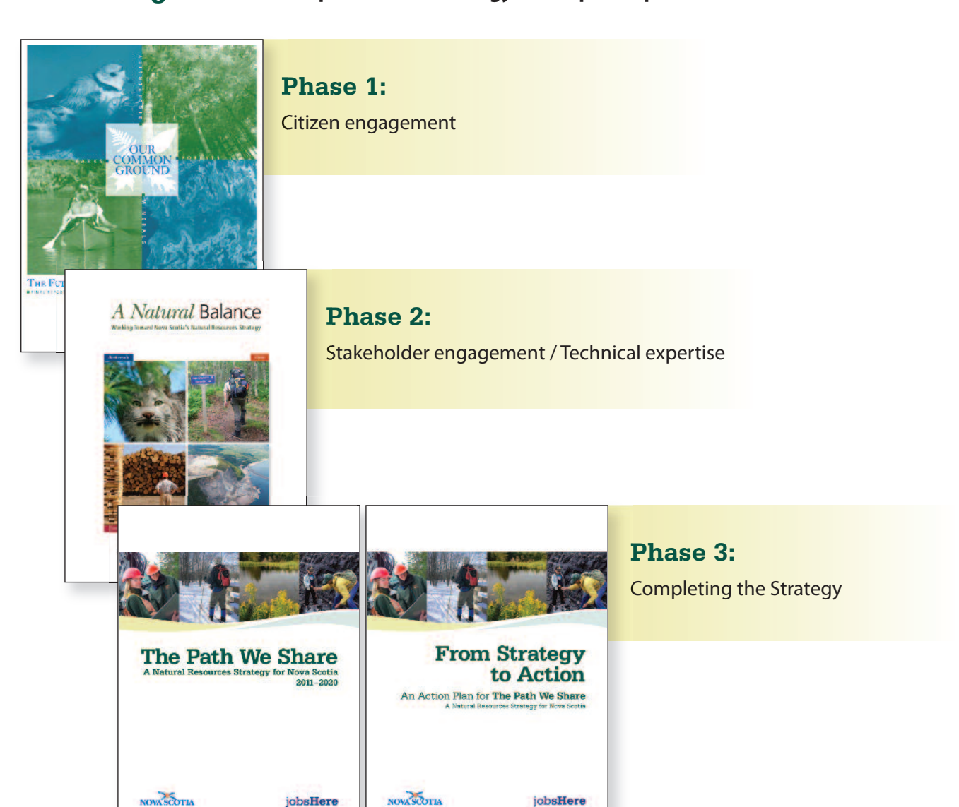
Figure A-1 Snapshot of the Strategy development process

Figure A-1 illustrates the publications that resulted from each phase of the strategy development process. For the full documents, go to www.gov.ns.ca/natr