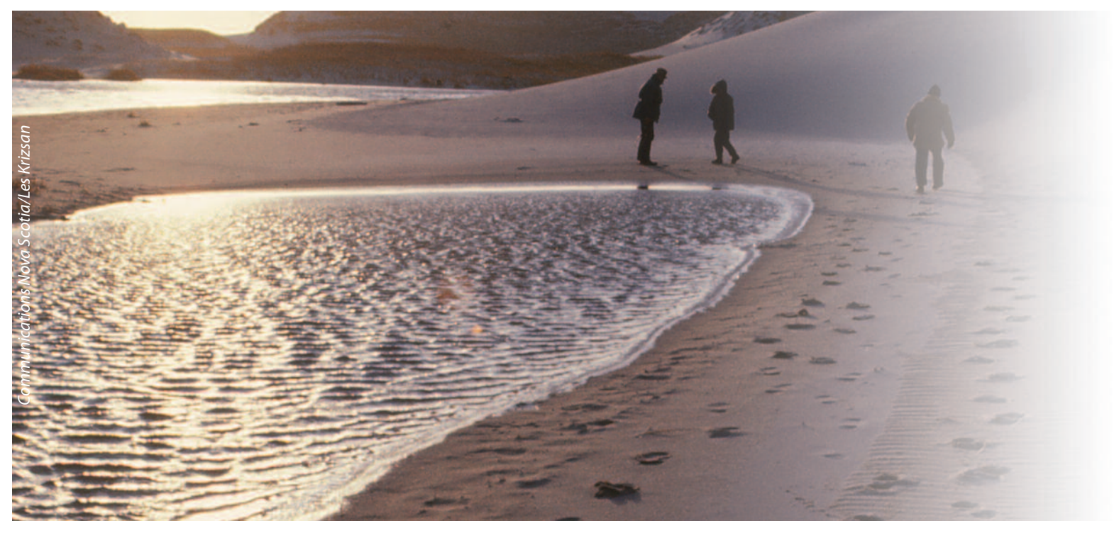
Sable Island, Nova Scotia