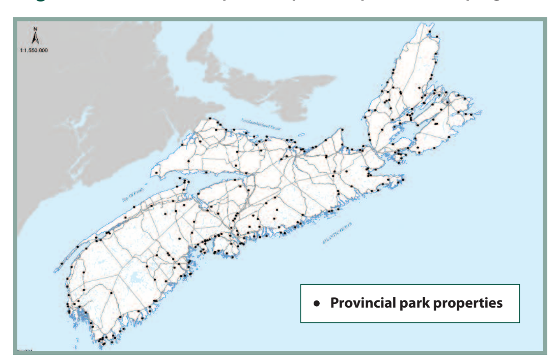
Figure 6-1. Nova Scotia's provincial parks and park reserves (Spring 2011)

Nova Scotia's provincial parks protect and showcase the province's natural diversity and cultural heritage, and encourage nature-based recreation, education, and tourism. (See Figure 6-2)