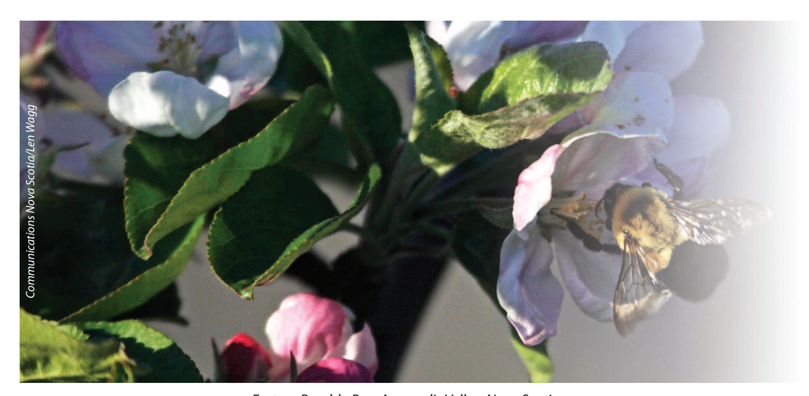
Eastern Bumble Bee, Annapolis Valley, Nova Scotia