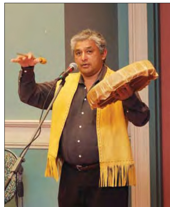
Traditional drumming is welcome in the classroom.

Teachers are a product of their own culture and consequently bring cultural baggage to the classroom. The challenge for non-Aboriginal teachers is the relinquishing of their own control as they respectfully listen to another viewpoint (Ogbu, 1982). This is a complex challenge; deconstructing and displacing the Eurocentric hegemony of “whiteness” and collaborating in the exploration of knowledge rooted in unfamiliar epistemologies (Hickling-Hudson & Ahlquist, 2003).